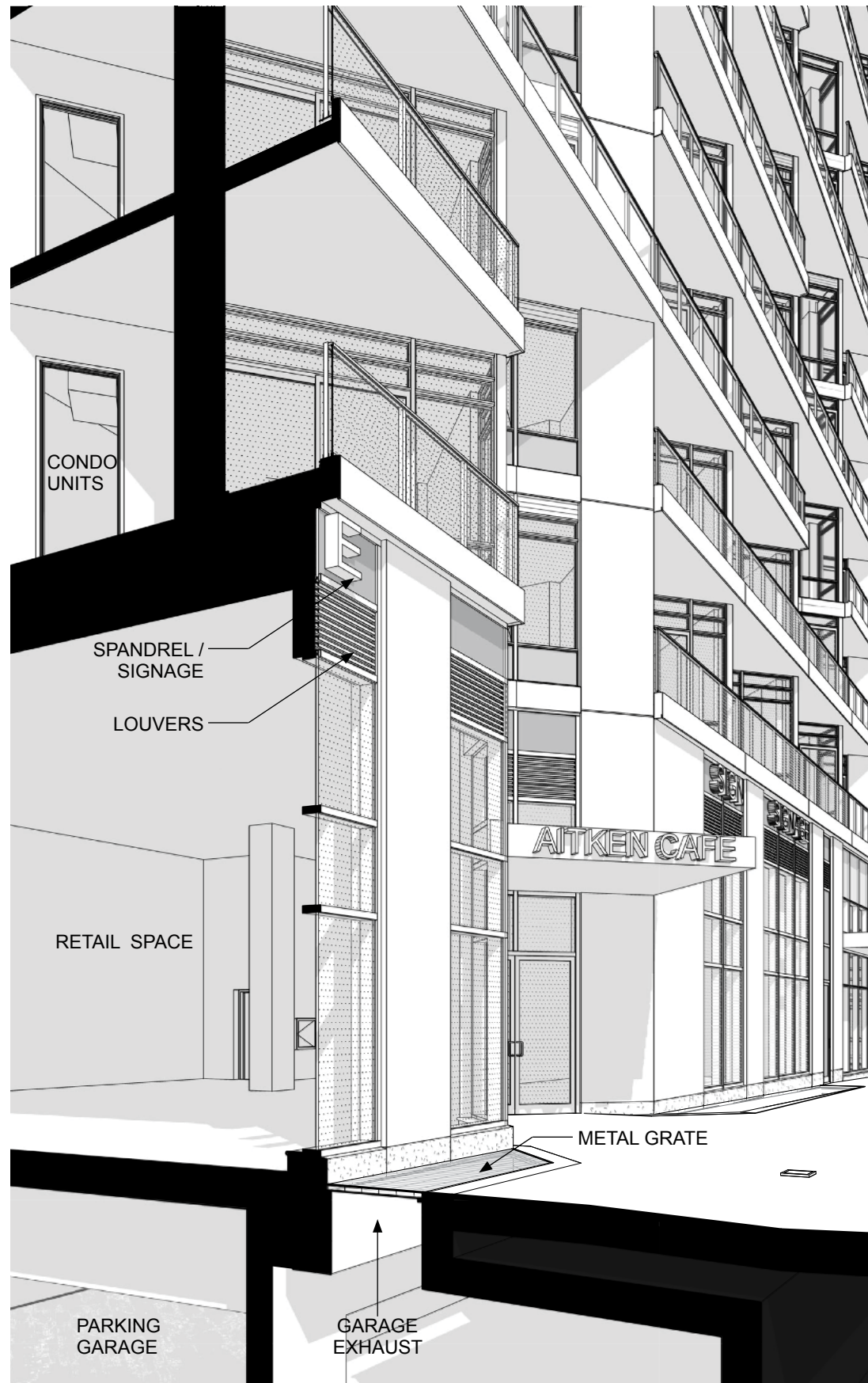
3D SECTION AT EAST RETAIL FACADE (N.T.S.)