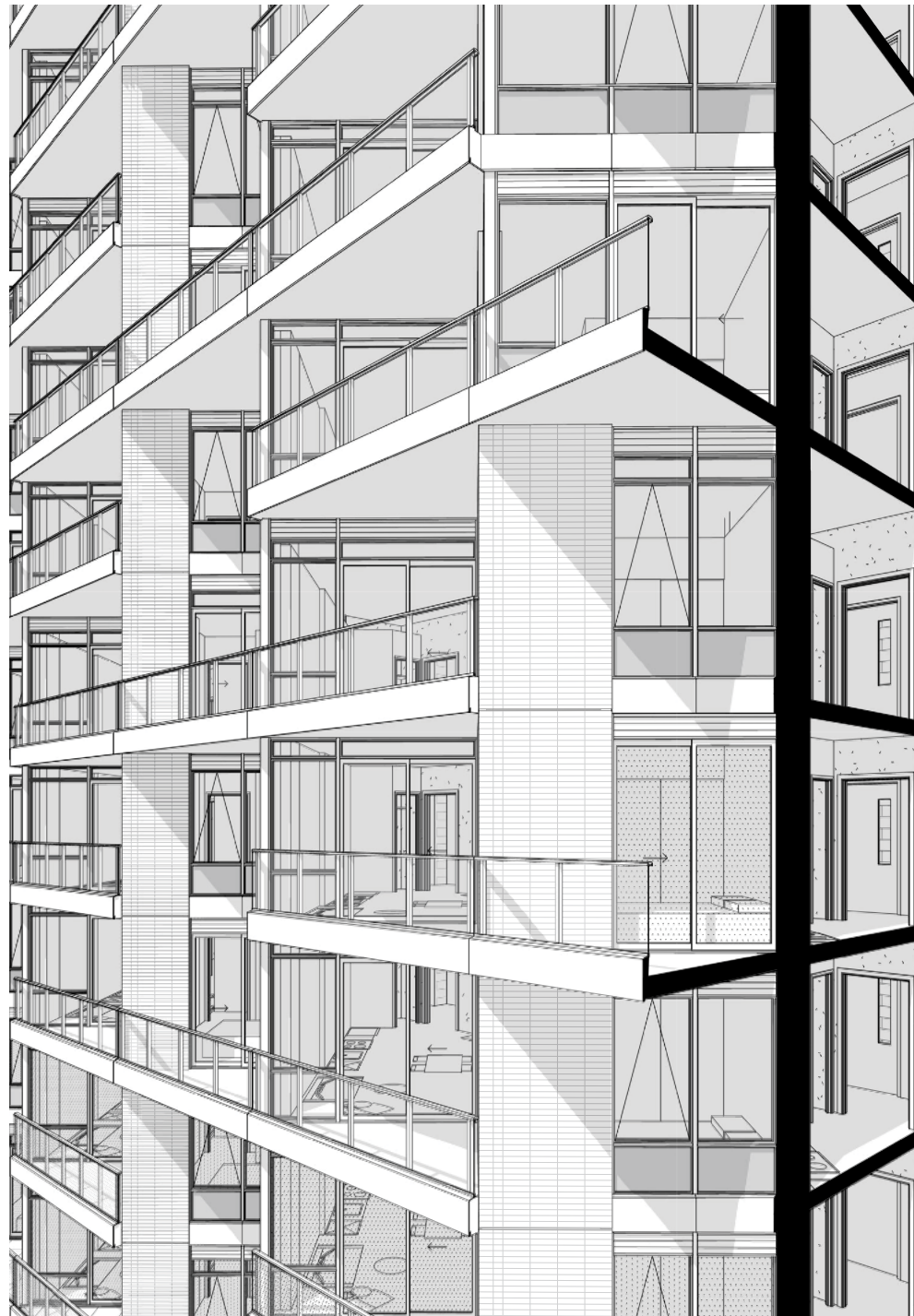
3D SECTION AT WEST CONDO LOBBY (N.T.S.)