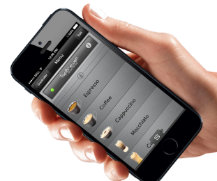
Customize your drink