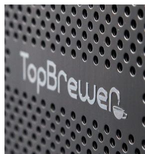
Stainless steel enclosure